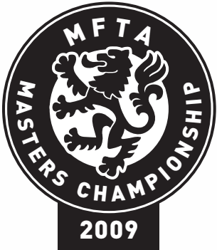
The Masters badge is a reflection of top shooting throughout the season.