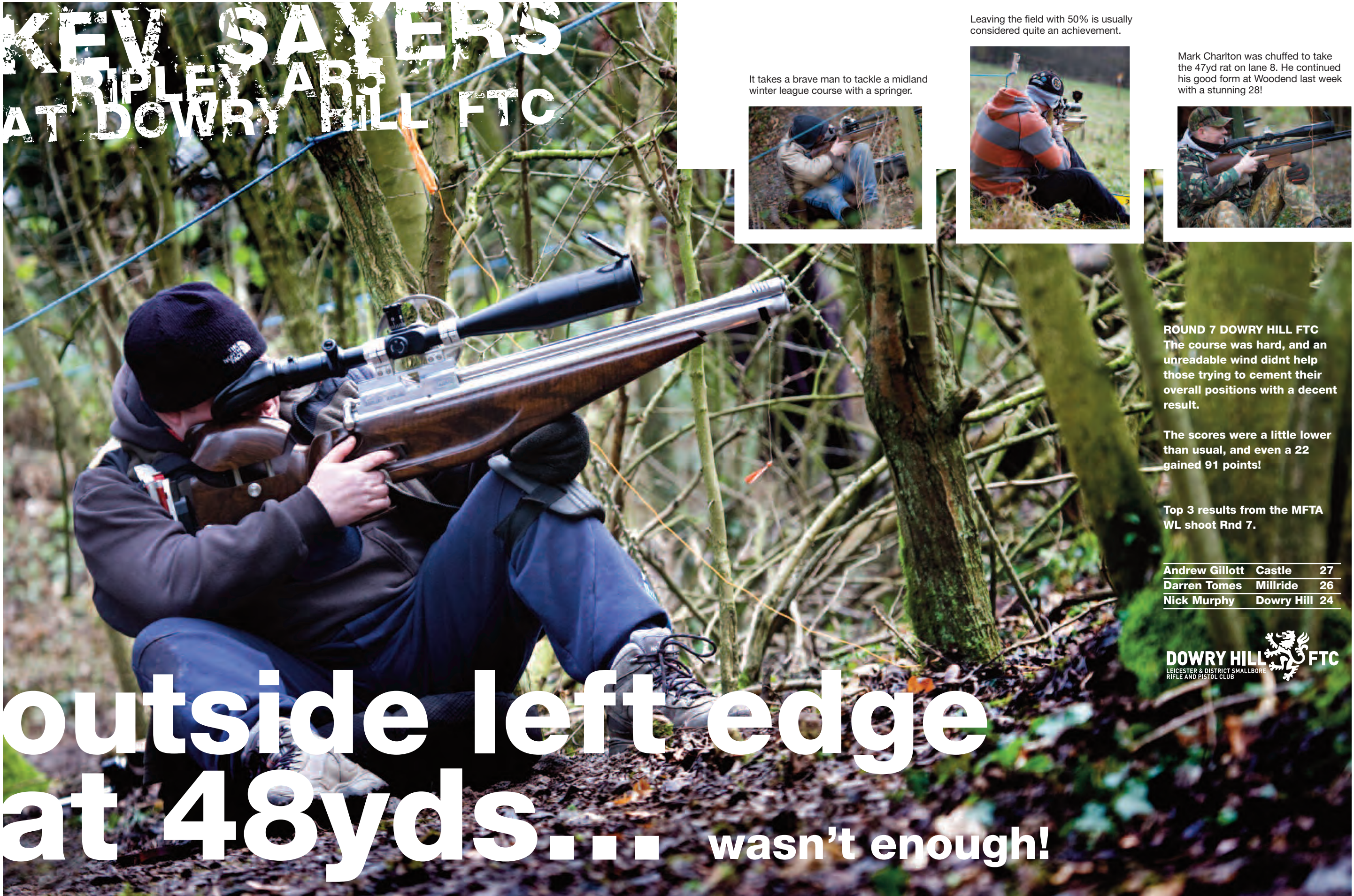
It takes a brave man to tackle a midland winter league course with a springer.